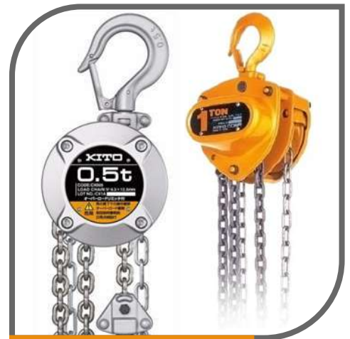
Chain Pulley Block