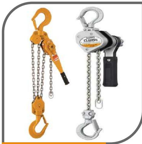
Ratchet Lever Hoist