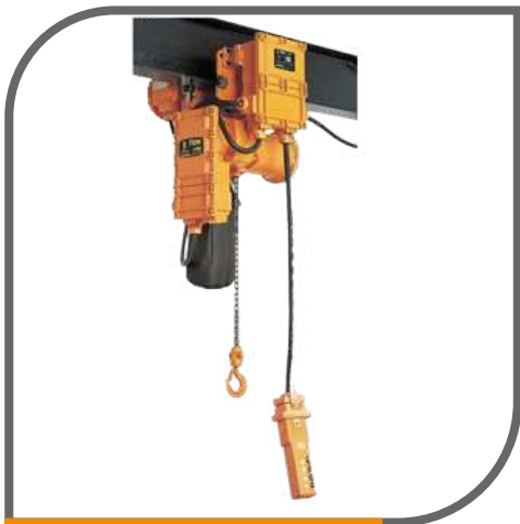
Flame Proof Chain Hoist