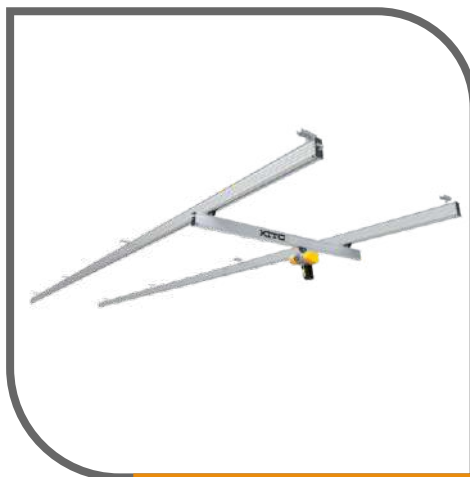
Light Profile Rails