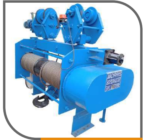
Wire Rope Hoist