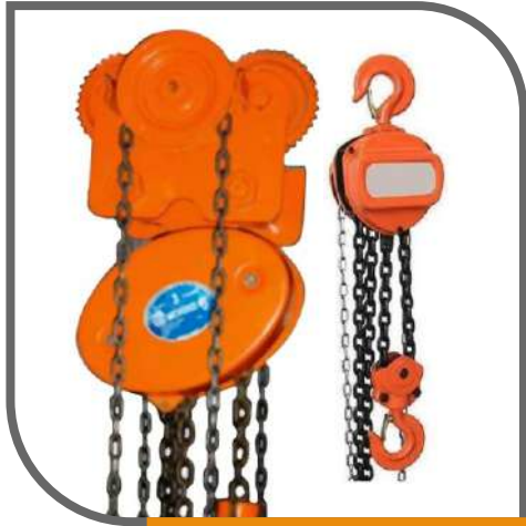
Chain Pulley Block