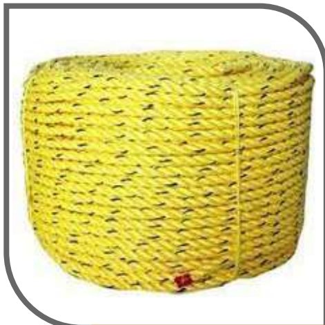
PP Rope/Mooring Rope