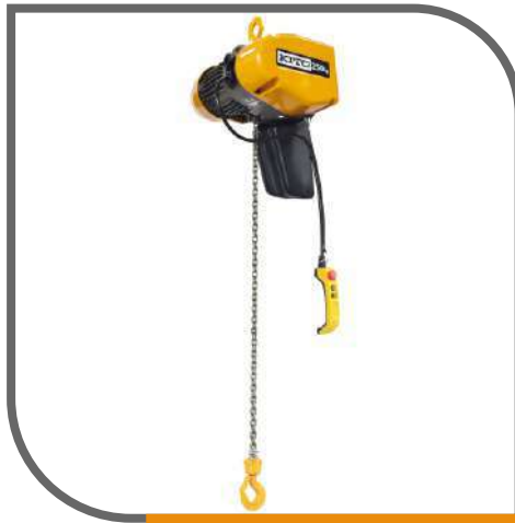
EQ Chain Hoist