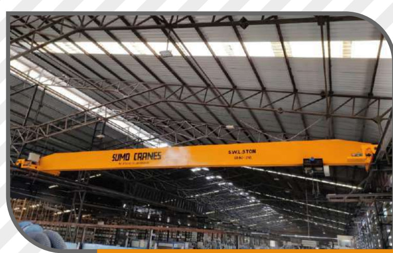
Single Girder EOT Crane