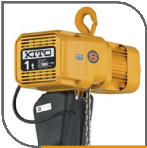
ER2 Chain Hoist