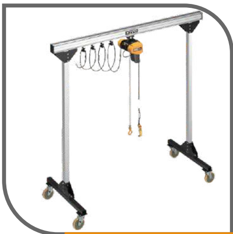
Portable Gantry Crane