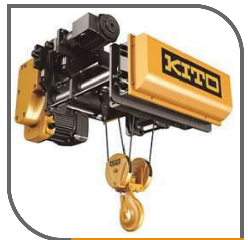
Wire Rope Hoist