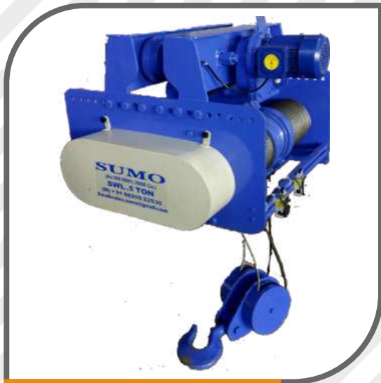
Wire Rope Hoist