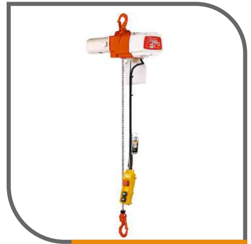
ED-III Chain Hoist